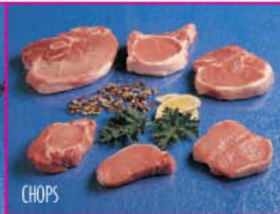
CHOPS Upper row (l-r): sirloin chop, rib chop, loin chop. Lower row (l-r): boneless rib end chop (Chef's Prime Filet™), boneless center loin chop (America's Cut™, 1 1/4-1 1/2" thick- ness), butterfly chop.