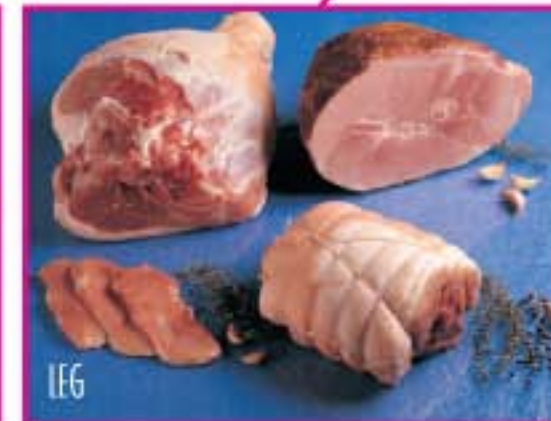
LEG Upper row (l-r): bone-in fresh ham, smoked ham. Lower row (l-r): leg cutlets, fresh boneless ham roast.