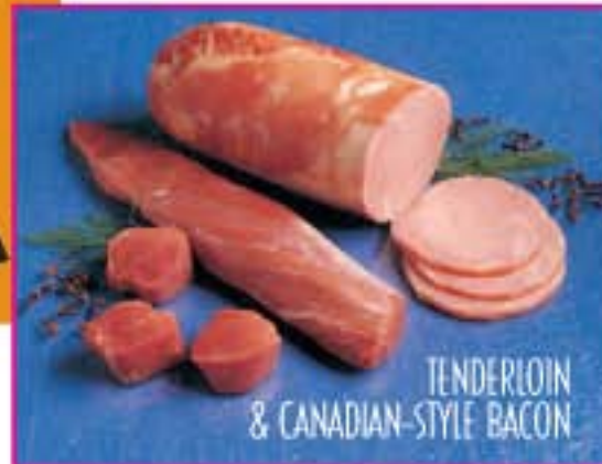
Left: tenderloin Right: Canadian-style bacon