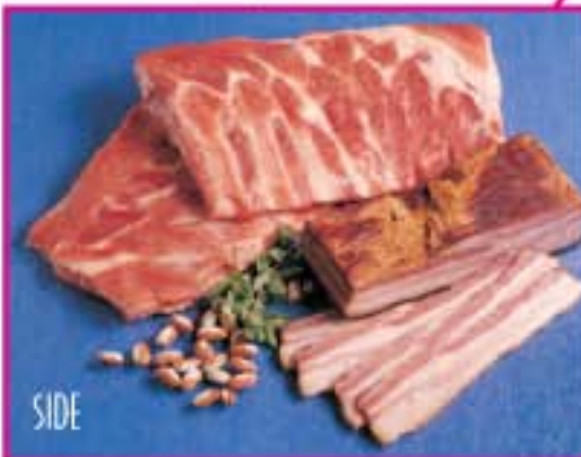
SIDE Top: spare ribs. Bottom: slab bacon, sliced bacon.