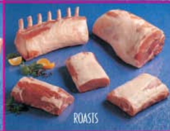
ROASTS Upper row (l-r): center rib roast (Rack of Pork), bone-in sirloin roast. Middle: boneless center loin roast. Lower row (l-r): boneless rib end roast (Chef's Prime™), boneless sirloin roast.